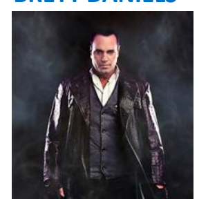
THE GRAND ILLUSIONIST